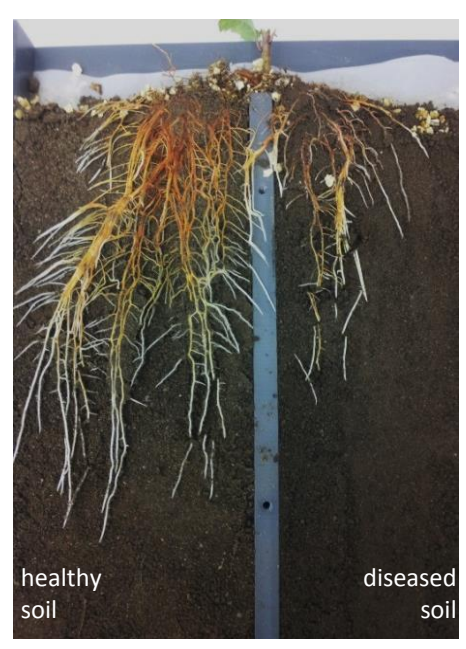
Fig. 2: Root formation of apple in healthy and diseased soil

The ORDIAmur project is investigating apple replant disease (ARD). The 15 projects (see back page) are structured in five work packages (Fig. 1). The joint project ORDIAmur aims at developing sustainable means to overcome ARD.